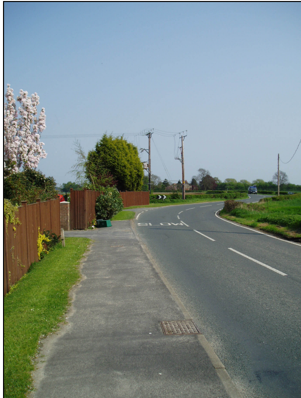
Figure 2 : Photograph showing the end of the footway outside No. 59 Temple Lane