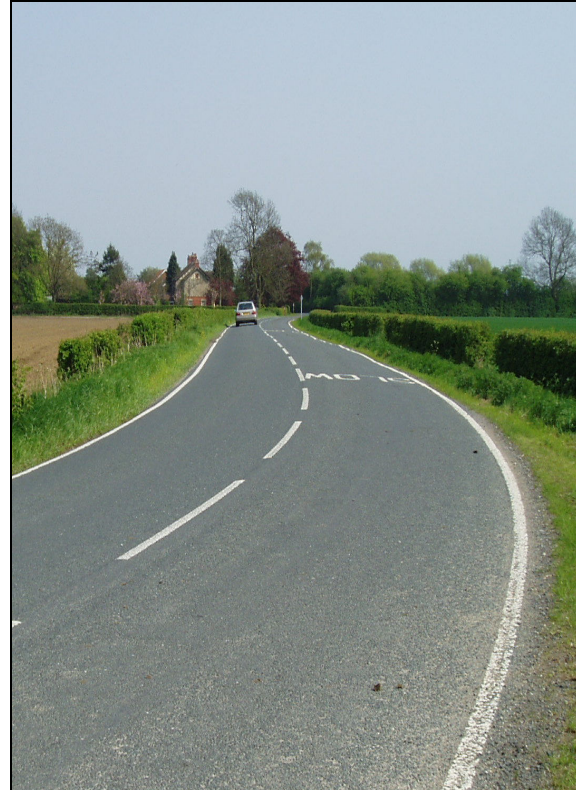
Figure 3 : Photograph showing the section of Temple Lane with no footway